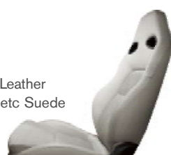
Gray Leather Synthetic Suede